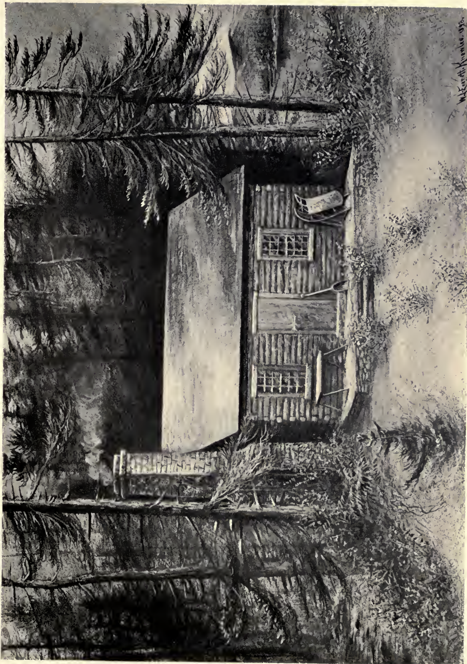
THE OLD TRAPPER'S HOME.